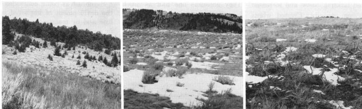
FIGURE 2. Left. Grazing results in a change of cover from grass to sagebrush and then to forest. Center. Sagebrush holds snow and delays spring melt. Palatable feed is available on snow-drift areas while snow-free areas have mature coarse grass. Right. Cattle tend to tramp out sagebrush. Hay was fed on sagebrush plants in this area during the previous winter.

is six weeks later than on the adjacent snow-free areas (Fig. 2 cen. ). The stock will not touch the unpalatable mature grasses until the snow-accumulation areas are grazed bare.