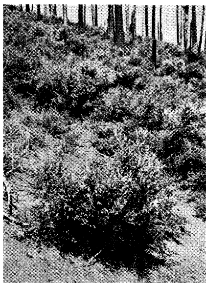
FIGURE 4. Deerbrush growth is slower and stands are thinner on shallow soils. A 15-year-old stand on a burn on the Stanislaus Forest.

In practically all areas there is some reinvansion of the forest. If trees do not form a full stand at the time deerbrush reaches its