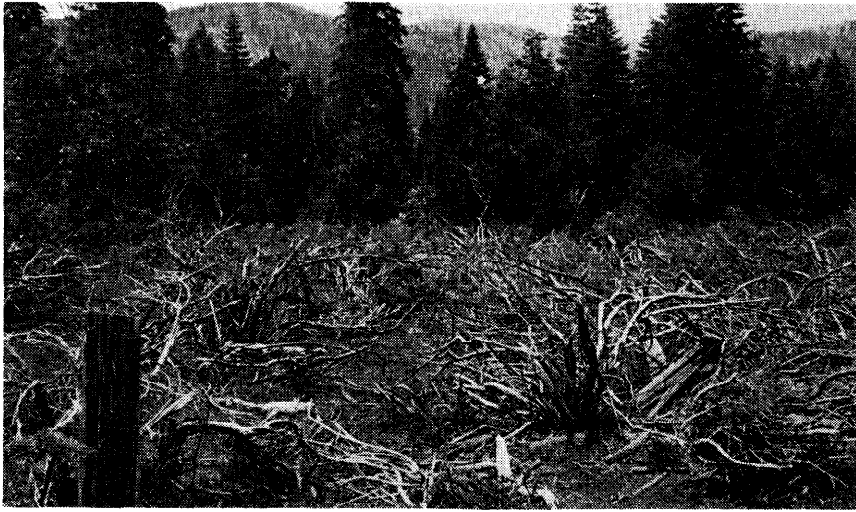
FIGURE 6. At 32 years deerbrush is reaching the end of its life span. Most plants are dead, and the remainder will survive but a few years, regardless of the degree of grazing. This area is in the optimum range of the species and had a grazing capacity of four cow-months per acre per year during the years of peak forage production.

In July 1942, an area of dense deerbrush on the Eldorado National Forest was reburned. This stand had originated from a fire in 1924. The shrubs were tall, and no foliage had been in reach of livestock for some years. Fuel was added by slashing a thin stand of small pines and cedars that survived the previous fire. This, together with severe burning conditions, resulted in an intense fire that consumed most of the plant material on the area. There was a heavy germination of deerbrush seed the following year—approximately 300,000 seedlings per acre resulted. These were reduced to one-half the following year by natural thinning, and deerbrush numbered about 1,500 per acre 8 years later. At that time the foliage again made up a full canopy. These findings were interesting but somewhat academic, since it is most difficult to reburn stands of this species. The severe burning conditions required raise the cost of ensuring the protection of adjoining timbered areas and other values. In addition, any timber values on the area are eliminated. There is also the further possibility that the stand will give way to less valuable shrubs.