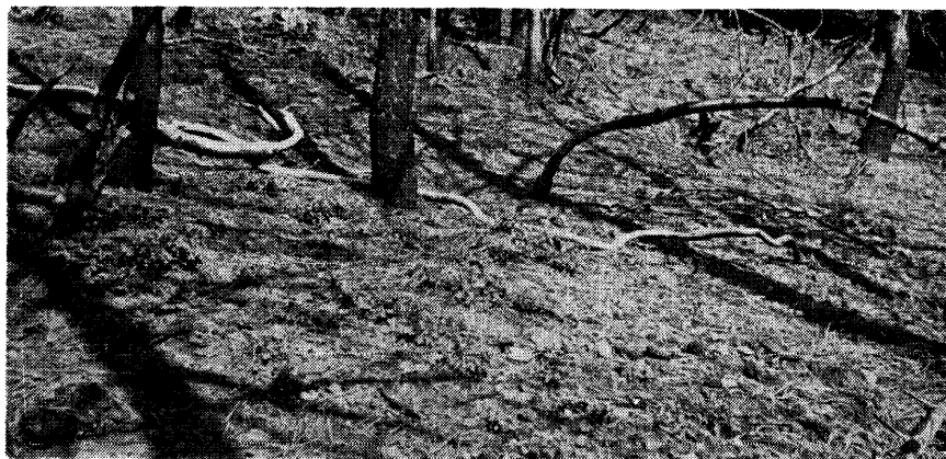
FIGURE 2. One-year-old seedlings following a burn in ponderosa pine—Plumas National Forest. The seedlings not yet conspicuous, are but a few inches high, and may be eliminated by close grazing.

browse on a segment of the range is indicative of its importance.