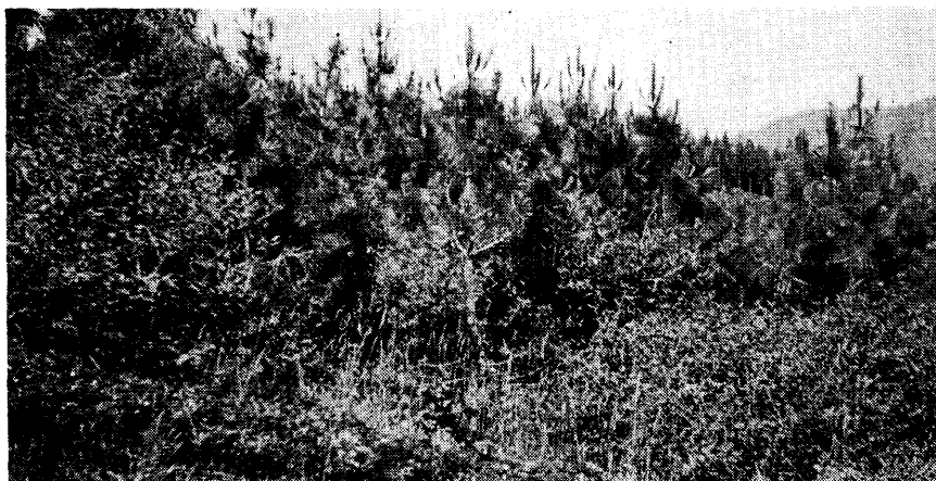
FIGURE 5. Ponderosa pine reproduction overtopping a 19-year-old stand of deerbrush. Shade is eliminating this intolerant shrub.

life span, grasses and sclerophyllus shrubs, such as manzanitas and bear clover in thin stands provide an understory.