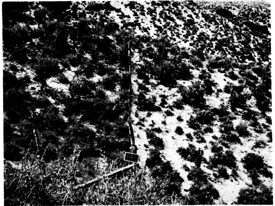
FIGURE 1. Gardner Creek exclosure, with the total-protected area (left) and the open-range area (right). Deer were responsible for the difference in browse. Photo taken in 1954.

In 1890, the range lands of Utah supported unregulated use by approximately 360,000 beef cattle and 2,000,000 sheep (Rasmussen and Gaufin, 1949). Heaviest livestock pressure on the ranges occurred from 1915 to 1920, as a consequence of the demands for meat created by World War I. Following that war, livestock reductions were effected, but concurrent with these reductions deer numbers were growing, so that total animal pressure was probably not much relieved (Julander, et al., 1950). By 1954, Utah's cattle numbers were increasing, while