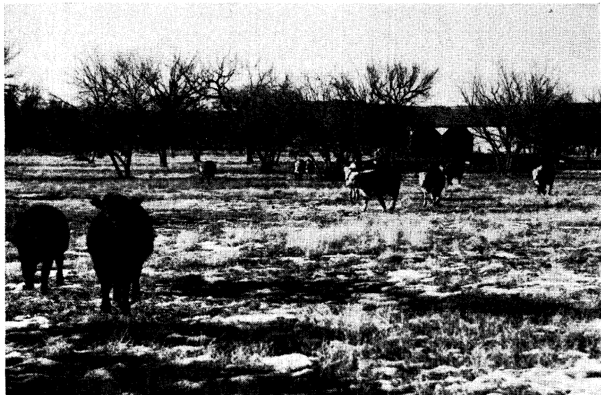
Calves wintering in protection of trees on the bottomlands of the White River at the DeJong Ranch.

windrowing early, when the protein is 7 to 9 percent in the native grass, this amount is preserved till eaten from the windrows by the cows. Alternate windrowing of one-fourth to one-third of the winter pasture provides double the amount of protein from the same grass, if it were all left standing. Usually the snow cover is light enough, so that the windrows are available to the cows most of the time from December to April.