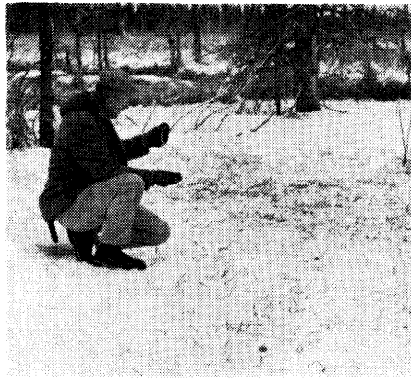
FIGURE 2. Stand of swamp horsetail heavily grazed by horses on a small, frozen, snow-covered pond.

The horses had avoided the open, treeless bog except where trails crossed it. There was virtually no evidence of grazing in the bog areas where vegetation consisted primarily of the low shrub sweet gale ( Myrica