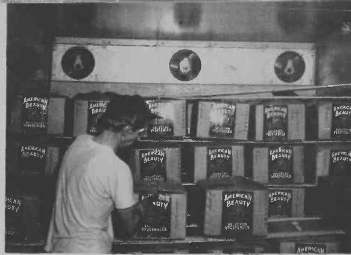
LOADING car of lettuce for fan pre-cooling test. Good ventilation is important.

During April, storage tests were conducted with Salt River Valley grown lettuce. A temperature of 42°F. is the maximum advisable for lettuce that is to be in transit for 10 days followed by a two-day wholesale period at 42°F. and a two-day retail period at 47°F. However, temperatures above 37°F. are not recommended during longer periods of transit. A temperature of 42°F. is too warm for